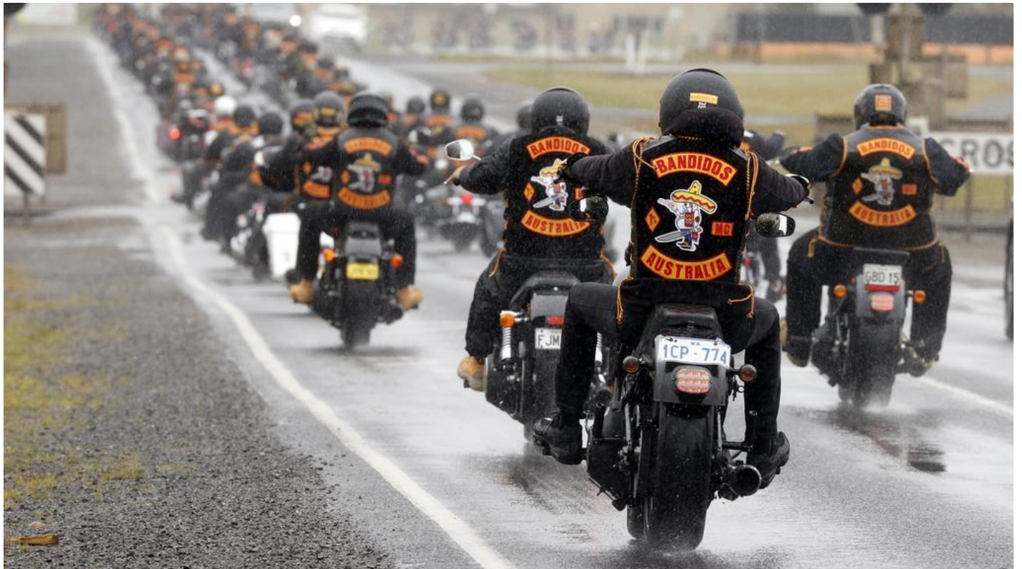
The Bandidos roar through Ballarat.